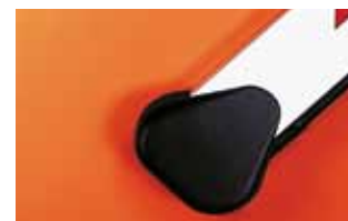
Fastening pocket for rectangular, round and pivoting round beams

Length 3,000 mm Item code 428176 Price (euro) 205.10 Length 2,500 mm Item code 428175