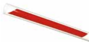
Pivoting round beams

Length 2,815 mm Item code 428089 Price (euro) 100.50 Length 2,315 mm Item code 428088