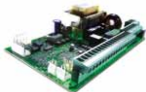
Built-in control board 624 BLD Technical specifications page 146