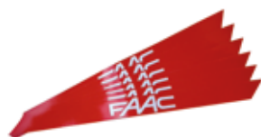
Reflective strip kit