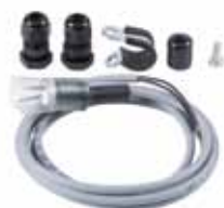
Kit for connecting S/L round beam lights (*)