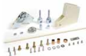
Articulation kit - max. ceiling height 3 m (only for standard rectangular beams)