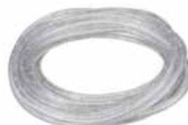
Luminous cord package containing 11 m