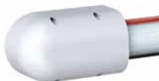
Fastening pocket for S 615/620 round beams