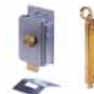
Various accessories page 168