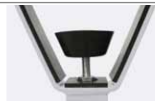
Adjustment screw for S/L round beam support fork